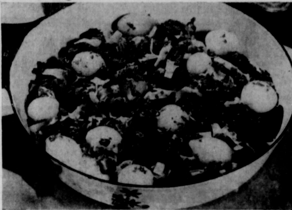
Beef and onion skillet stew is made with the help of packaged soup mix.