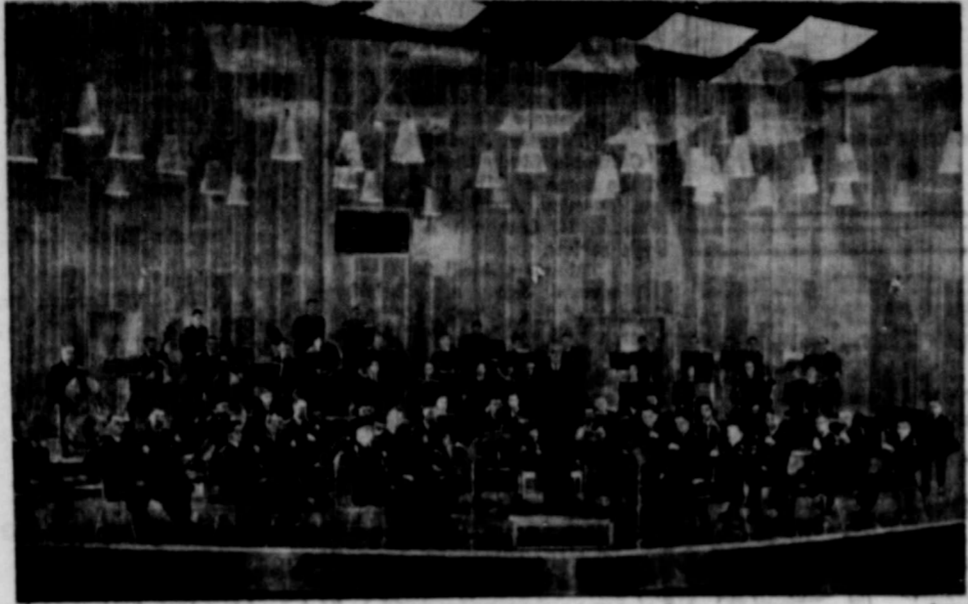
The Seventh U.S. Army Symphony Orchestra on stage for a presentation of music to an audience of Germans and Americans. Founded in June 1952, the U.S. Army Symphony Orchestra is the only one of its kind. The Orchestra has performed over 800 concerts to a world audience of well over half-a-million persons. Each musician in the orchestra is a trained combat soldier with military duties in addition to his function as a musician.