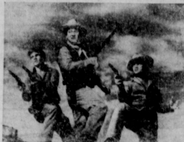
Heading a star-filled cast in Howard Hawks' "Rio Bravo", exciting Technicolor western drama for Warner Bros., are Ricky Nelson, John Wayne and Dean Martin. The picture also stars Angie Dickinson, Walter Brennan and Ward Bond.