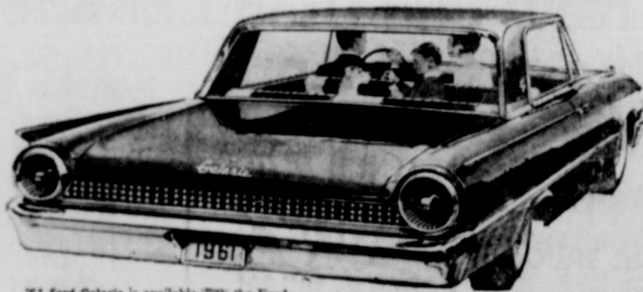
'61 Ford Galaxie is available with the Ford 292 V-8 that won the low-price V-8 class in the Mobilgas Economy Run with 21.3 mpg!

Why is the Ford Galaxie head and shoulders above all the imitators?