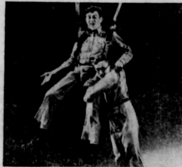
Second feature, "No Time for Sergeants", stars Andy Griffith, Myron McCormick and Nick Adams. Both pictures show Friday and Saturday at the Majestic.