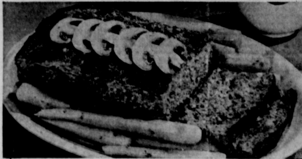
Fresh vegetable beef loaf is a man-sized economical treat for the whole family.