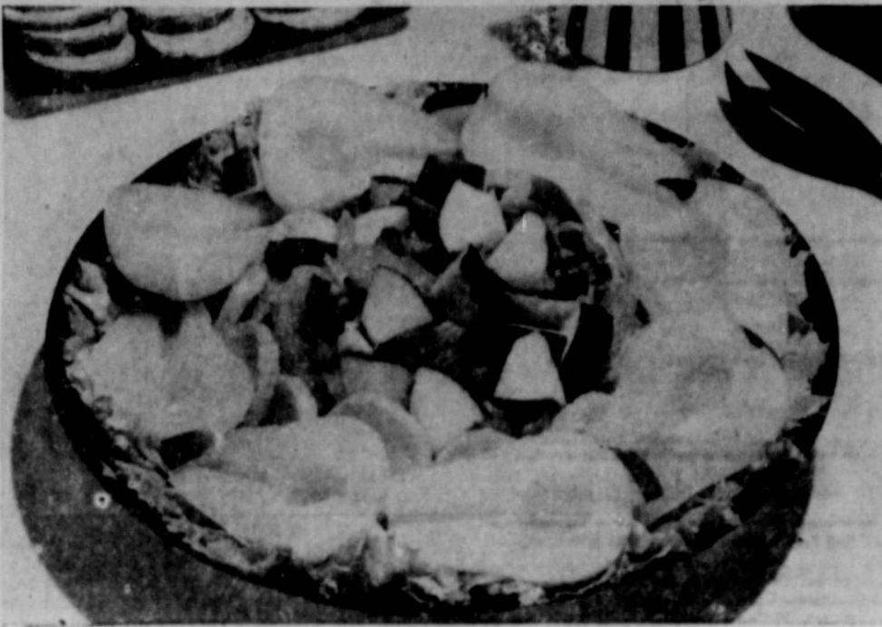
Canned pears are no strangers to this table.