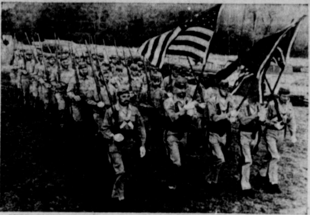
RIFLES PASS IN REVIEW—The Lexington, S.C., "Rifles" march after 100 years. Men of the group, which marched in the president's inaugural parade, grew beards for the town's Civil War centennial celebration.

Ranger has something to offer others—let's wrap it all together in a bright package, tie a big red bow on it a large number of last minute