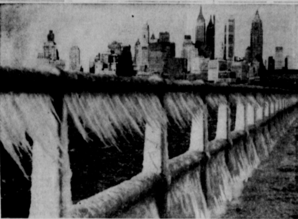
FREEZY DOES IT — The New York skyline presents a chilly picture from the icicle draped promenade of Governor's Island in the middle of New York Harbor.