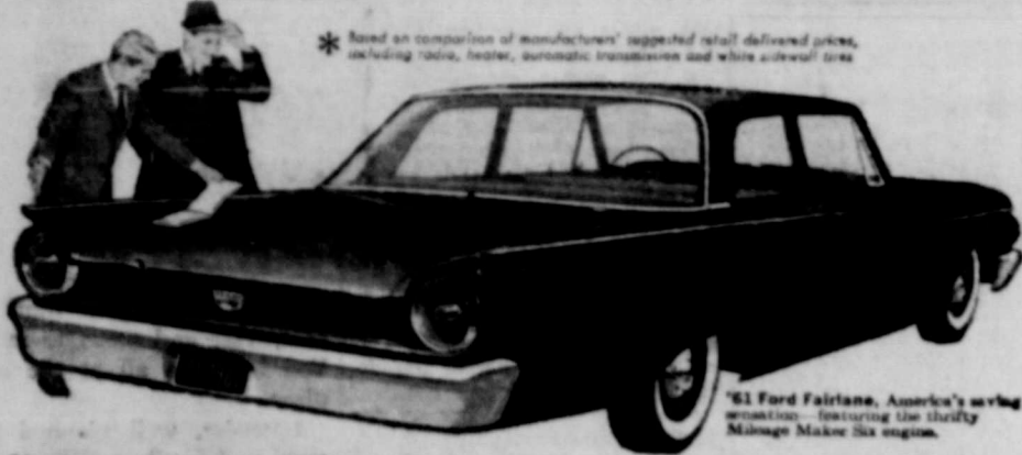
*Based on comparison of manufacturers' suggested retail delivered prices, including radio, heater, automatic transmission and white exterior paint.