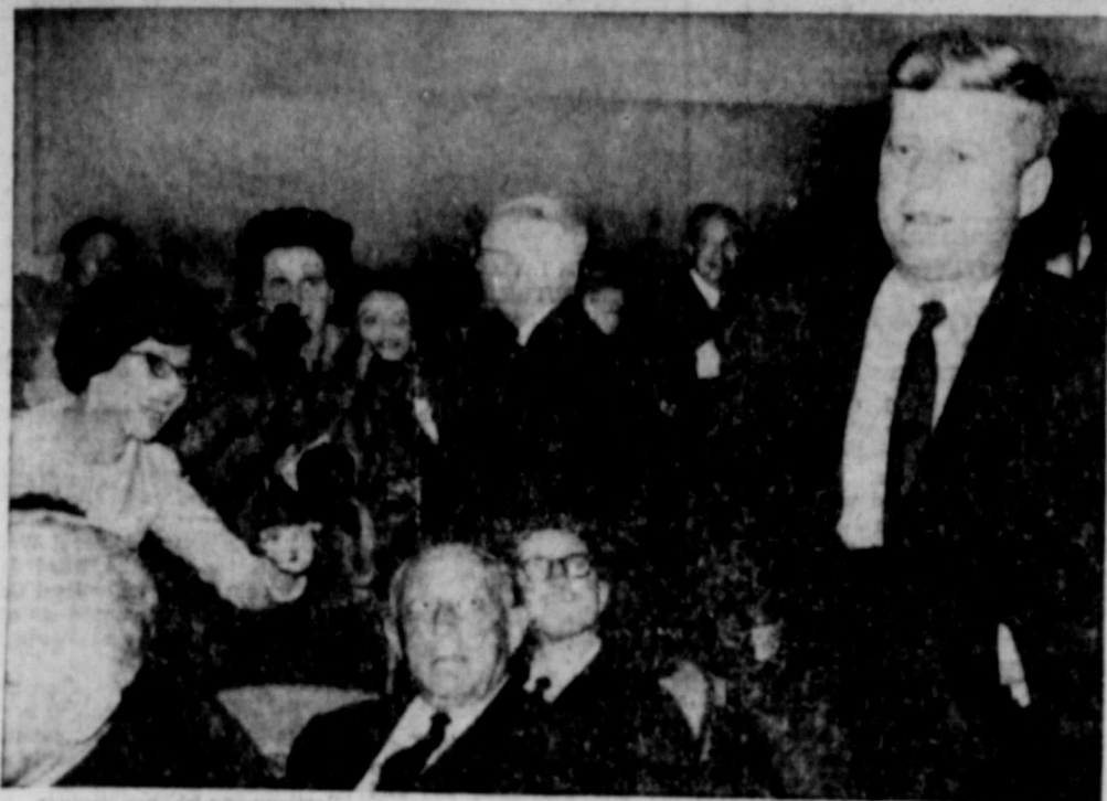
NONE OTHER THAN JFK—Theater-goers at the Broadway show, "Do Re Mi," receive an unexpected bonus as they see President John Kennedy take his seat in the orchestra. He attended the musical shortly before the inauguration.

With the weather still threatening the announcements for school to resume Friday, was made with the condition that the roads would remain clear. This is if there is not a bad icing condition Friday morning, all classes will resume.