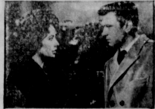
ELIZABETH TAYLOR speaks her mind to LAURENCE HARVEY in MGM's "BUTTERFIELD 8", dramatic CinemaScope and color drama.