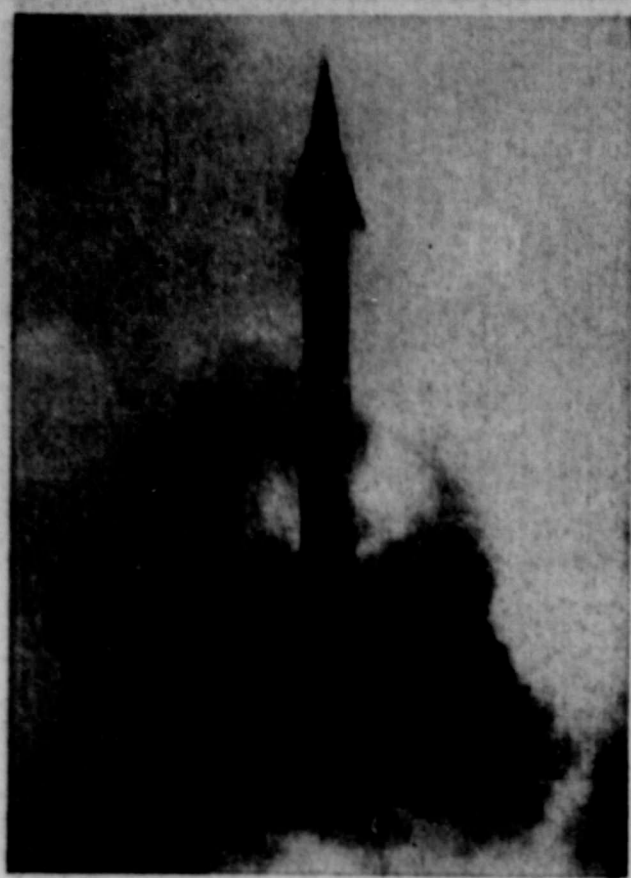
UNDERWAY: The prototype rises swiftly from the launching pad. Army spokesmen forecast a NIKE ZEUS firing in 1961 from Kwajalein Island to intercept an incoming ICBM launched 4,500 miles away in California. The NIKE ZEUS will meet and master the ballistic missile threat presented by the Soviet Union.