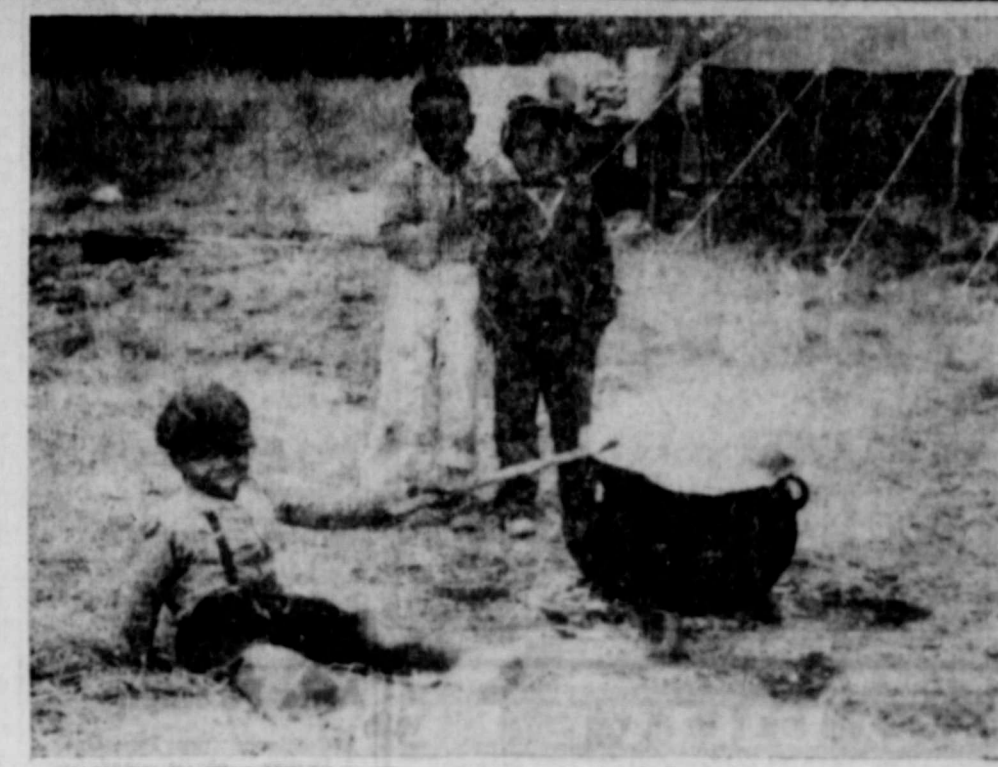
CAUGHT IN THE MIDDLE—Three children of evicted share croppers play near a fire in a tent community in Somerville, Tenn. The U.S. Justice Department has moved to halt the evictions of several hundred Negro tenant farmers in two counties who claim they are being forced off the land because they registered to vote.