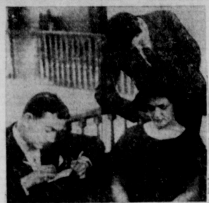
POWERS' WIFE MEETS PRESS —Pondering question, Mrs. Barbara Powers, wife of U-2 pilot Francis G. Powers, is shown at Moscow press conference. Mrs. Powers said she considered her husband a reconnaissance scout, not a spy. She, along with Powers' parents, is attending his trial.

The MODERN Pest Control Offers FREE Estimates on Termites and Pest Control. Scientific methods. We have a complete line of insecticides. 101 Main Ph. MI 7-3422 Ranger