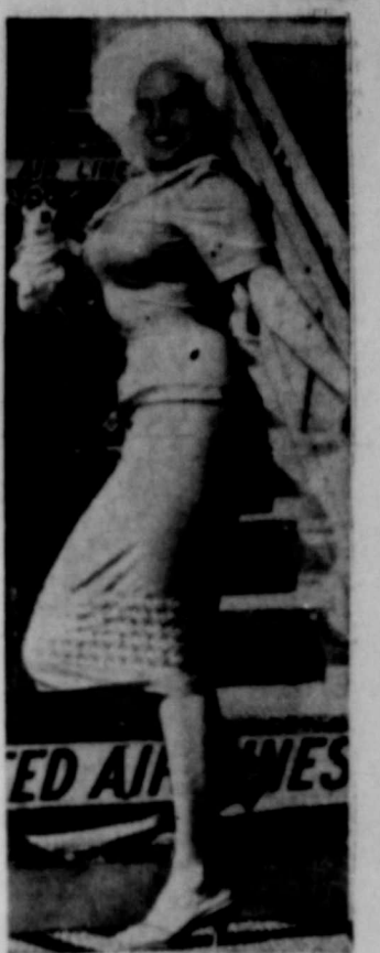
JAYNE AGAIN —Jayne Mansfield gets "caught" again by the camera. This time in San Francisco where she deplaned to reign as "Race Queen" for sports car races.