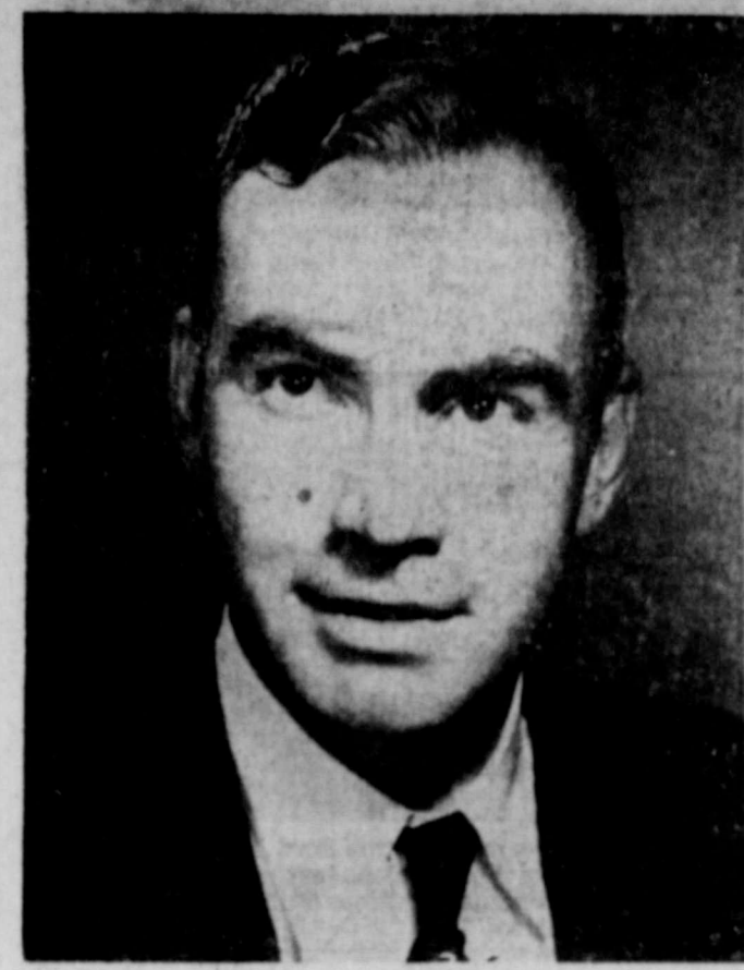
Congressman Jim Wright

The offering which is taken Sunday morning at the communion table will go to support the work of the church, to help churches who minister to military personnel and their families and to enable Methodist to relieve human suffering in lands overseas.