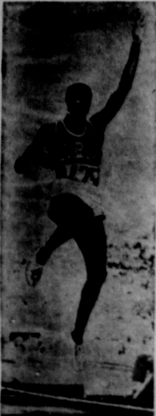
RECORD FALLS —Ralph Boston, of Jackson, Miss., seems to be reaching for the stars as he leaps to a new Olympic broad jump record of 26 feet, 7 1/2 inches.