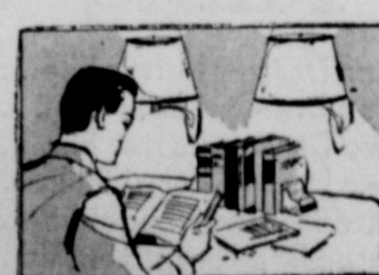
in diffusing bowls may be used when study table is placed against a light-