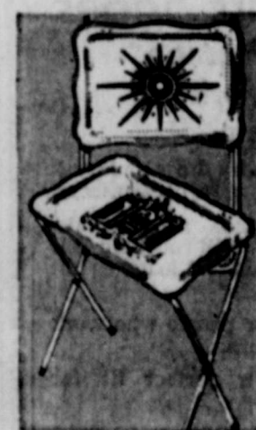
TRAY AND STAND TV SNACK TABLE

sizes 4 to 14 The style girls adore! Sturdy, well-made! Penney's rib-trim cotton winter-weights come in stylish aqua, maize, pink. Compare, get Penney's low price!