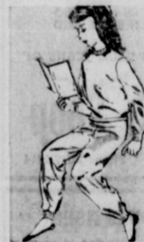
SPECIAL! KNIT SKI PAJAMAS!

oval or oblong Over 9 square feet—fine in hall or entry! Use pairs in bedrooms, others to protect carpet! Slip-resistant. White, beige, green, rose, sandalwood, lilac, grey.