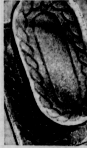
27 BY 50 INCHES! COTTON PILE RUGS

20 by 32 inch mat, lid cover You get soft, springy viscose rayon pile! Slip-resistant! Machine wash, medium set. White, pink, rose, brown, yellow, lilac, green.