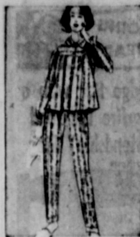
TOASTY COTTON FLANNELETTES!

A real stock up and save price! Heavy shimmering quality! Lined with lace, pleating, embroidery. Slip, petti... shadow paneled. White, pink, blue.