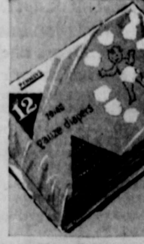
SPECIAL! 20 by 40 GAUZE DIAPERS

Pick up several at Penney's low price! Legs have bright brass finish—tray has scalloped edges; in assorted patterns. 12 7/8 by 17 1/2-inch tray. Folds flat.