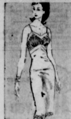
AVISCO RAYON TRICOT LINGERIE