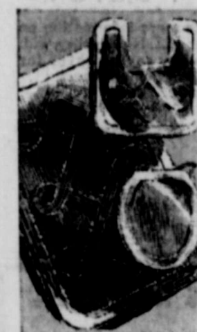
COLORFUL 3-PIECE BATH SPECIAL!

Terrific buys! Take your pick of colorful prints, three handsome styles! All generously cut, neatly finished! Soft machine washable quality. Sizes 32 to 40.