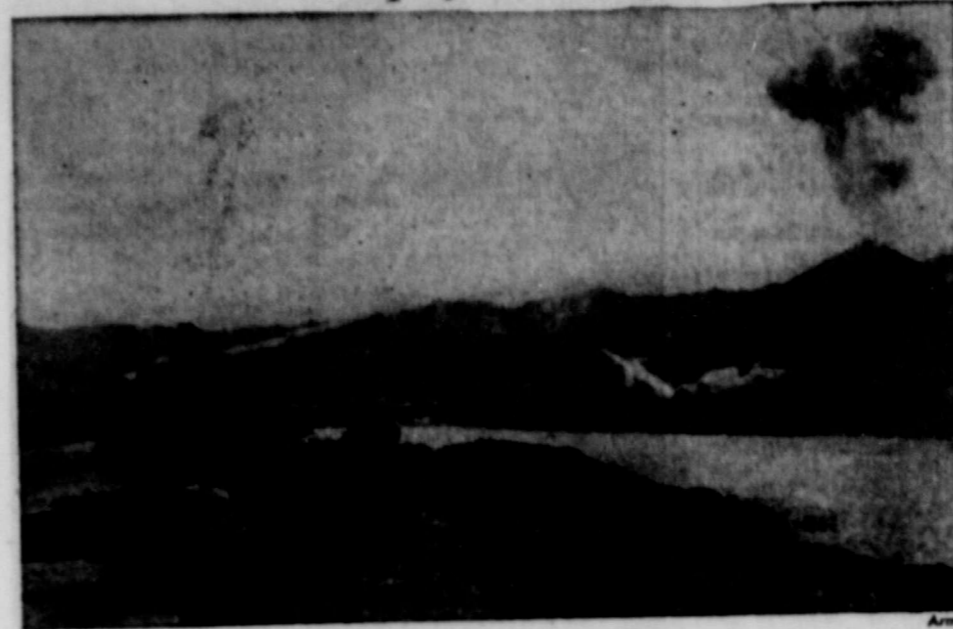
A SPECTACULAR REVIEW is launched in Korea as the HONEST JOHN rocket thunders off its launcher seconds after the 8-inch Howitzer, left, is fired. A simulated atomic detonation is visible on top of a nearby mountain. The U.S. 7th Infantry Division deployed along the Bamboo Curtain in Korea maintains a high degree of readiness for employment—Any Time—Any Place—Any War.