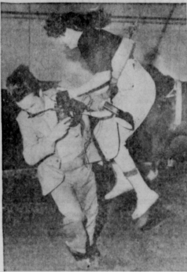
CAUGHT SNAPPING—Too intent on his picture taking, a photographer is bowled over while snapping circus action at Ascot, England. The lady's aim was to swing onto a galloping horse, but the shutter bug got in the way. Nobody hurt.