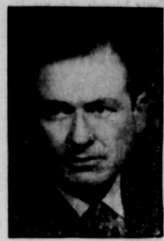
REP. OMAR BURLESON to address peanut producers

LEGAL VANDALISM Checking a report of vandalism, police in South Bend, Ind., found a man smashing fenders and hood of his car and breaking its windows—after the car stalled on him in traffic.