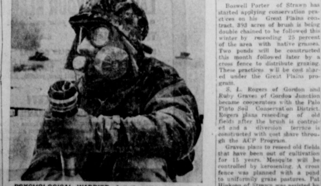
PSYCHOLOGICAL WARRIOR—Just the sight of this U.S. soldier, dressed in chemical, radioactive protected gear, could send the enemy running in fear. The practical, but not beautiful, costume is seen during maneuvers in Germany.

The school, sponsored by the State Firemen's and Fire Marshals' Association of Texas and conducted by the Engineering Extension Service, is now in its 31st year, and attendance at the school has increased from the 196 who attended the first school to the anticipated 1600 who will participate this year.