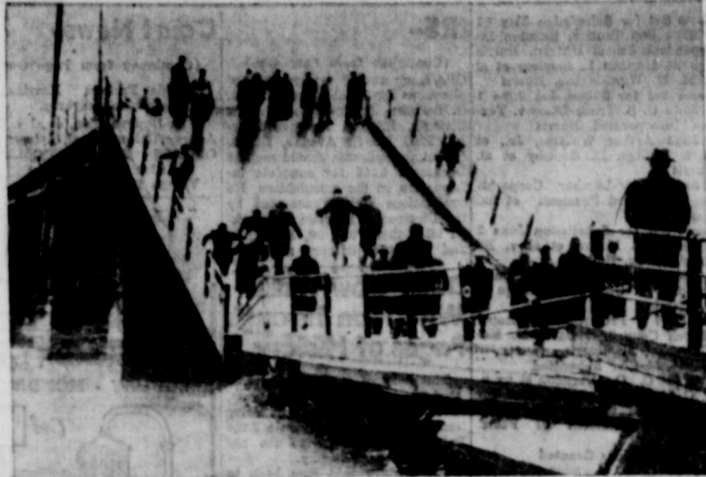
TWO-LEVEL BRIDGE —Pedestrians walk uphill as they cross this bridge in Concepcion, Chile, leveled by the great earthquake.