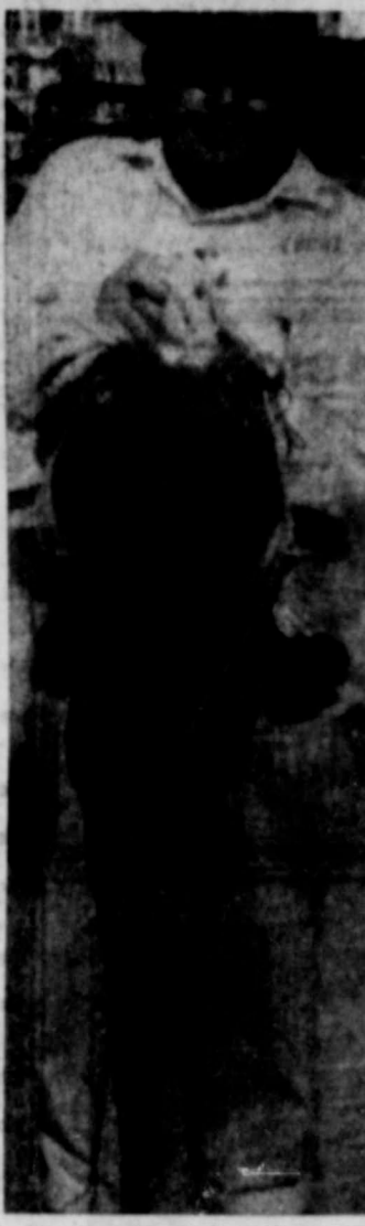
A BIG ONE—O. M. White holds a big yellow cat he caught at the Texas Electric Service Co. power plant lake recently. The big one hadn't been weighed, but White guessed it at close to 30 pounds.