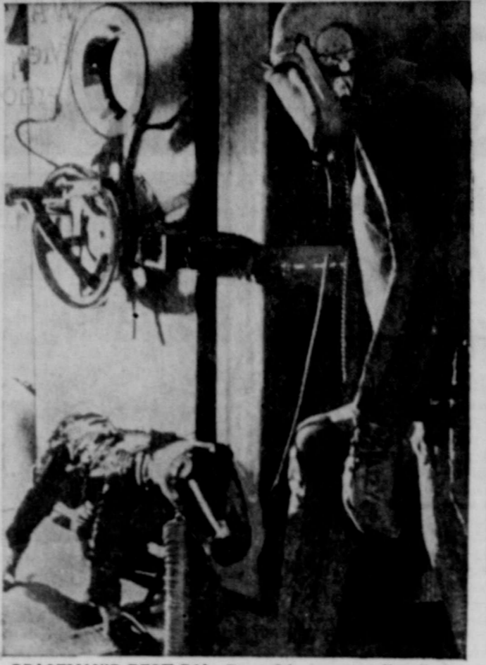
SPACEMAN'S BEST PAL—Dressed in a space suit, a Russian astronaut enters a pressure chamber in Moscow accompanied by a dog, also dressed for space travel. They are testing effects of simulated flight on the human and canine bodies.

"The Real Purpose of the Student Council" Winters High School. Lunch was served at the Cisco National Guard Armory. Entertainment was presented by groups from Ballinger, Albany, Comanche, Coleman, Anson and Stephenville.