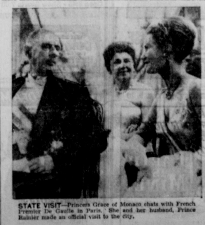
STATE VISIT—Princess Grace of Monaco chats with French Premier De Gaulle in Paris. She and her husband, Prince Rainier made an official visit to the city.