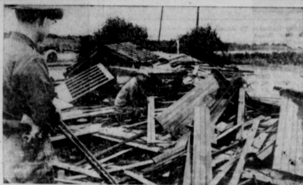
ALL THAT'S LEFT—Little more than kindling wood remains of a Baptist church after a tornado churned through New Mesquite, Tex. Nobody was killed when the church collapsed.

Carbon's Wolverines host Desdemona Thursday night at 7:30 in a six-man football game. This is the first time in years that Desdemona has fielded a team, and the game will renew an old rivalry. FREE HOME TRIAL RCA WHIRLPOOL APPLIANCES at RANGER FROZEN FOOD CENTER