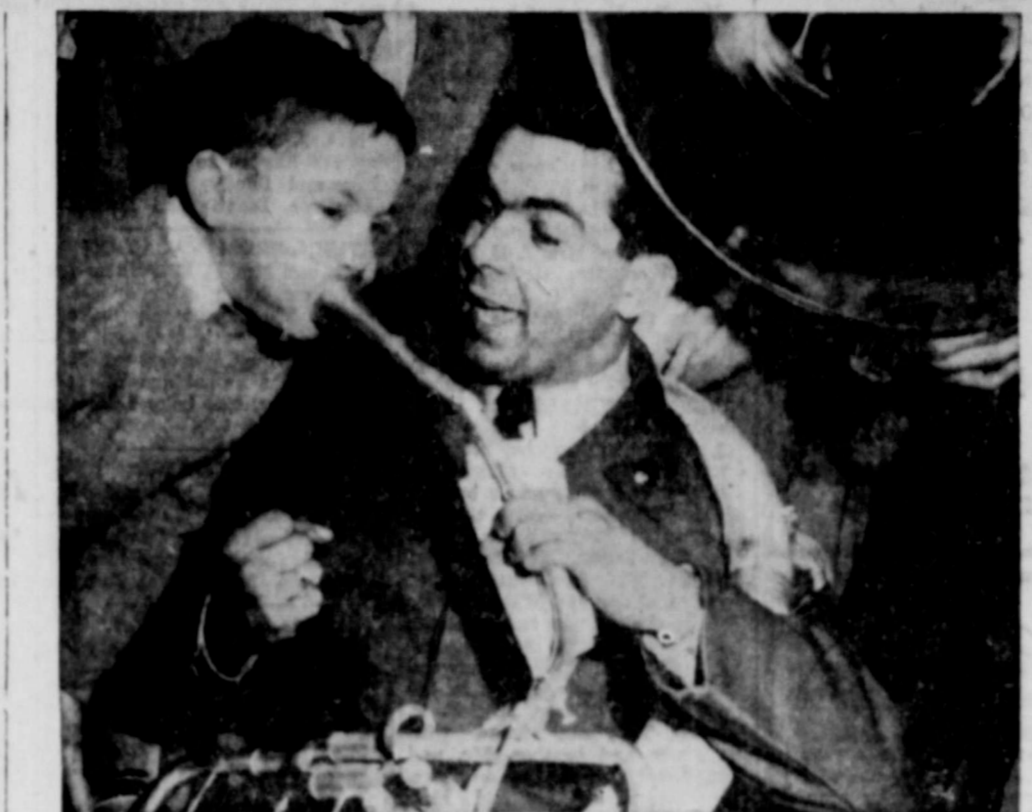
NO SOUR NOTES HERE—U. S. Army deployed forces not only serve as our first line of defense but as ambassadors of good will. Typical is this cultural exchange between a musician of the 49th Army Band, stationed in Italy, and a local Italian lad who gets a tuba audition during intermission. In the past several years more than one million Italians have heard concerts by the 49th.