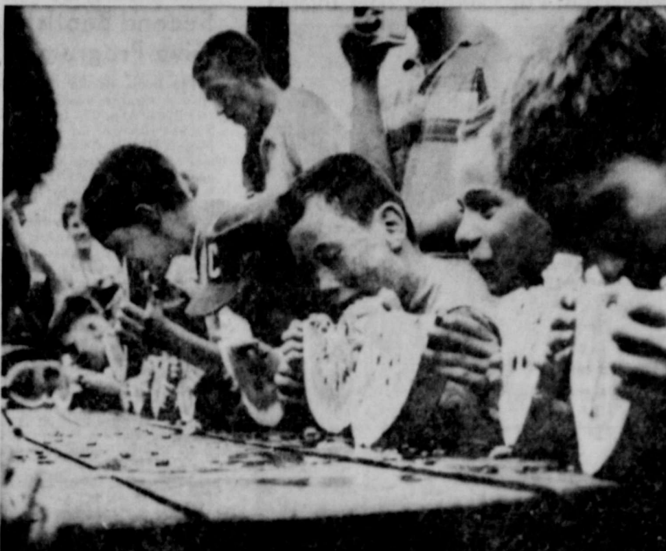
CHOMPING TO VICTORY —It was every man for himself when the Highland Park Boys Club of Detroit, Mich., staged their watermelon eating contest. Winners received, of all things, watermelons.