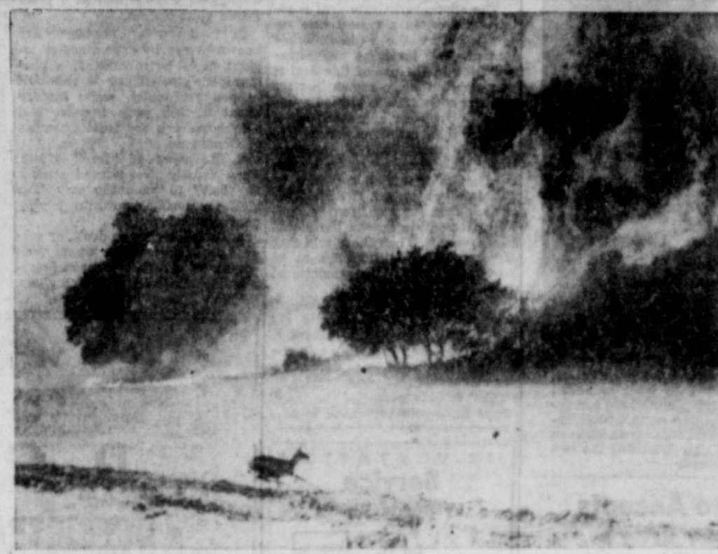
WILD TERROR IN CALIFORNIA-A doe dashes in blind fear as flames leap from a brush fire in Hidden Valley, Calif. Firefighters halted this blaze after it blackened nearly 200 acres

the children of today get called juvenile delinquents for doing the