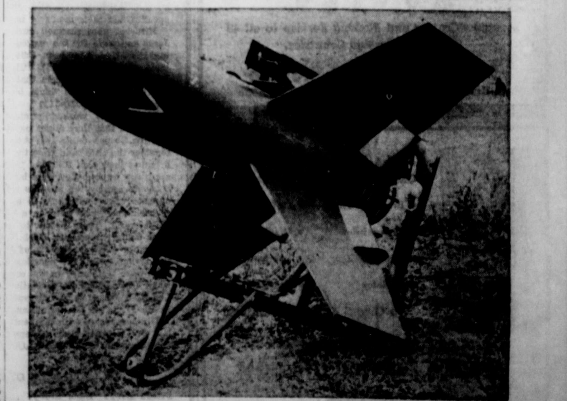
KILLER—The Department of the Army has announced that the SS-10 anti-tank missile, shown above, will be procured for use by the U.S. Army. The SS-10 was developed and manufactured by Nord Aviation of Paris, France.