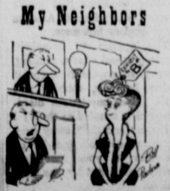
My Neighbors We present Exhibit B, representing an expenditure of $2,000 a month of the union's welfare fund, for secretarial and advisory service.