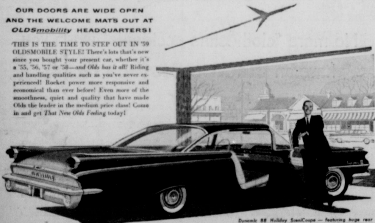
Dynamic 88 Holiday Semi-Coupe—featuring huge rear window of tinted heat-resistant glass as standard equipment

THIS IS THE TIME TO STEP OUT IN '59 OLDSMOBILE STYLE! There's lots that's new since you bought your present car, whether it's a '55, '56, '57 or '58—and Olds has it all! Riding and handling qualities such as you've never experienced! Rocket power more responsive and economical than ever before! Even more of the smoothness, quiet and quality that have made Olds the leader in the medium price class! Come in and get That New Olds Feeling today!