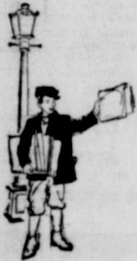
General Medaris is the first commander of America's new Missile Command. He has been a member of the Armed Services since 1918, when he enlisted in the U.S. Marine Corps at the age of 16. Prior to that he worked as a newspaper boy in Springfield, Ohio—and supplemented this with another job: turning gas street lamps on and off along his newspaper route!