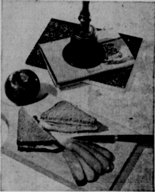
Pickles are a delicious solution to the problem of how to dress school sandwiches in taste-tempting style.

Combine kraut, cream, mayonnaise, onion and Worcestershire sauce; mix well. Arrange kraut mixture and beef on bread.