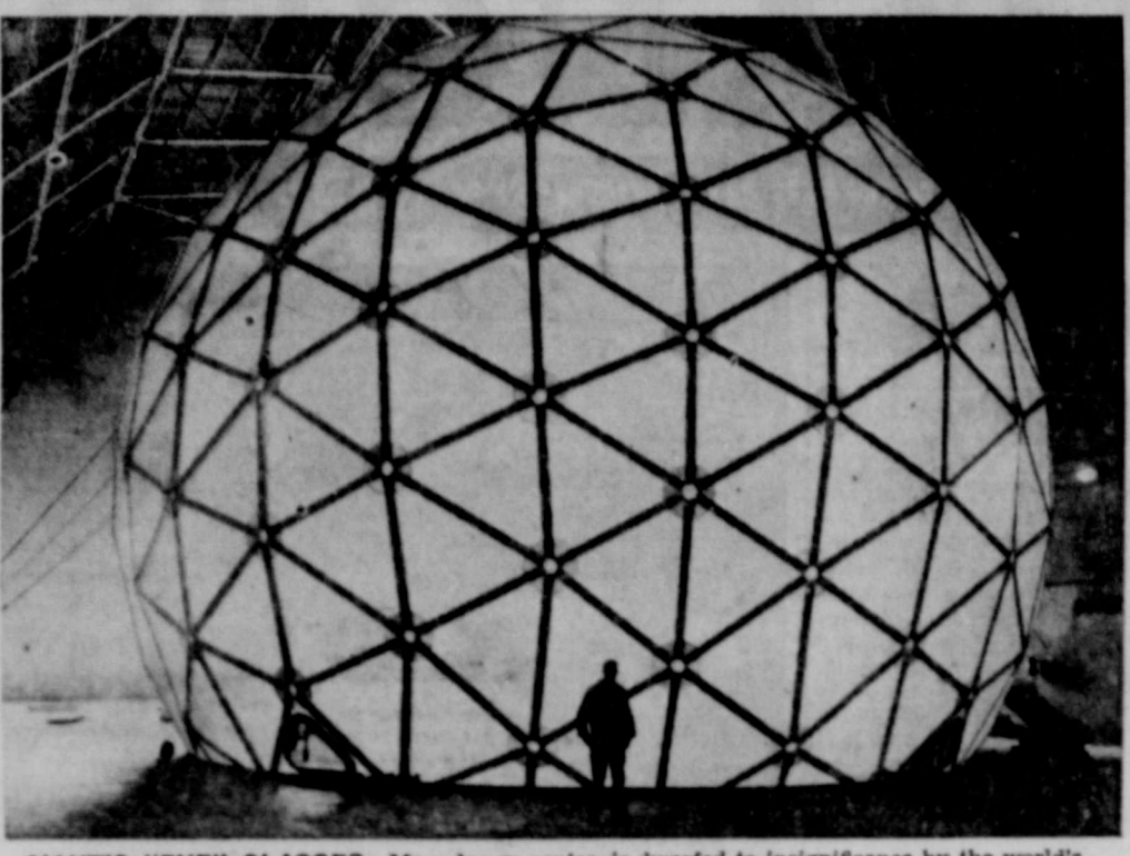
GIANT'S "EYE" GLASSES—Man, lower center, is dwarfed by insignificance by the world's largest glass fiber radome. The huge shelter for a radar antenna is 68 feet in diameter and more than seven stories tall. Laminated plastic panels bolted together in a few basic panel groups can be erected or disassembled in about 80 hours by a six-man crew. The unit, shown in a hanger in Akron, Ohio, weighs some 30,000 pounds, all told. It takes up shipping space the equivalent of eight boxcars, but units are so light that they can be airlifted. The forerunner of radomes well over 100 feet in diameter, it was built for the Air Force.