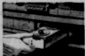
Portable Transistor Radio is removable from glove compartment for use as self-powered portable. (Optional at extra cost.)

Behind the wheel of a Pontiac you enjoy a feeling of security you've never known in all your years of driving. With the widest stance on the road and a low, low center of gravity, Pontiac clings to the curves without lean or sway. And the same great advance gives Pontiac a decided edge over other cars in the way it smooths the bumps and holds straight and true against crosswinds. Try it and see!