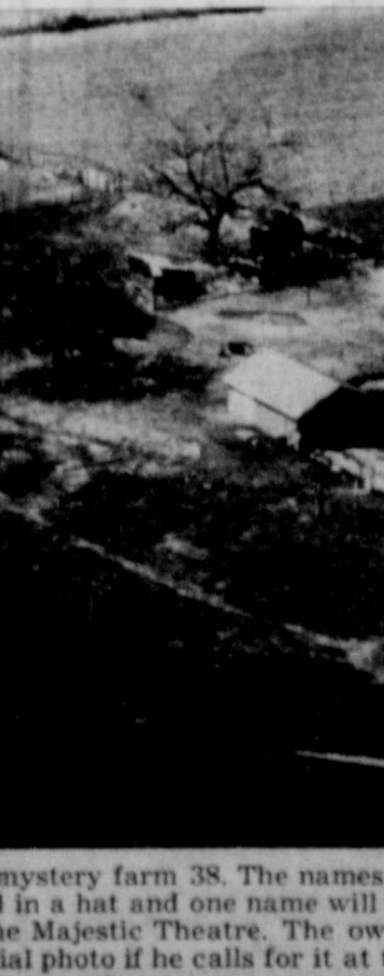
MYSTERY FARM—Here is mystery farm 38. The names of all persons correctly identifying the farm will be placed in a hat and one name will be drawn out.