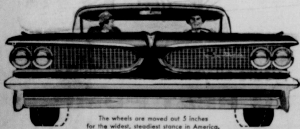
The wheels are moved out 5 inches for the widest, steadiest stance in America.

No "narrow-gauge" car hugs the road like PONTIAC!