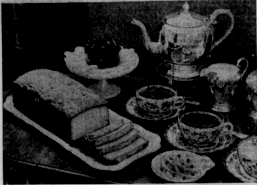
Old-fashioned pound cake loaf, brandy-flavored dates and spiced lemon slices are fine accompaniments for tea. Be sure that tea is prepared correctly for this traditional treat.

Some time ago, at the Newspaper Food Editors Conference in New York, there was a "Boston Tea Party" given for the visiting food experts.