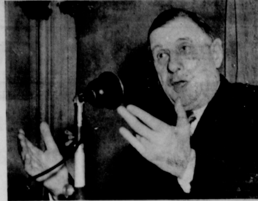
"MON GENERALE"—Gen. Charles de Gaulle, shown in a recent photo, is the man many French affectionately call "Mon Generale." Leader of the Free French after the fall of his country to the Germans in the early stages of World War II, De Gaulle came back to assume leadership over the liberated country. Shortly after he quit in disgust at the bickering splinter parties in the National Assembly. Now, at 67, he's back, ready to take over control of the Republic, "if the people wish, as in the preceding great national crisis." But the man who once referred to himself as a "modern Joan of Arc" had many obstacles to overcome before he could attain this position.

Paint Special • Vinyl-Latex flat wall finish • Modern decorator colors • Apply by brush, roller or spray • Dries fast . . . recoat same day • Beautiful flat matte finish • Easy clean-up with soap and water 3.49 Per Gal. Burton-Lingo Co. Phone 61