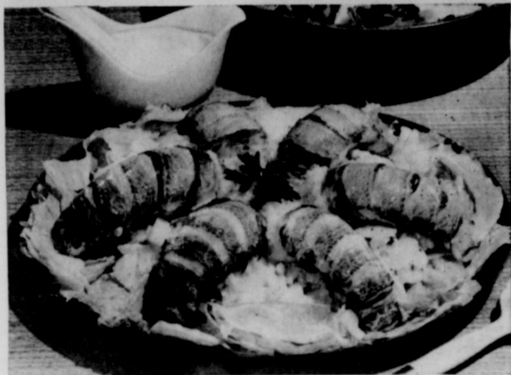
Rock lobster tails served with potato salad and tangy dip are enticing.

For a very special late supper party on the Sunday evening buffet get-together, lobster tails give a touch of elegance.