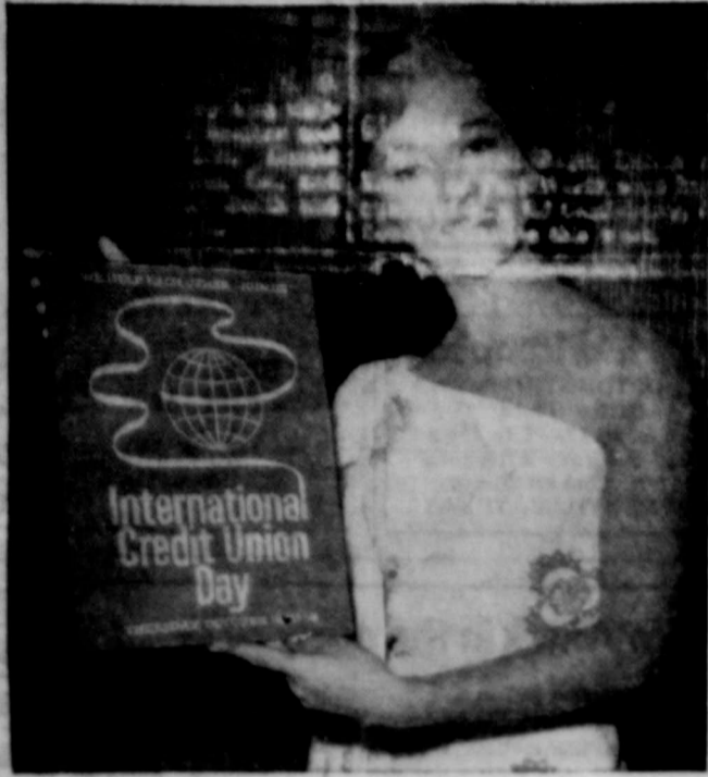
HOLLYWOOD—Lovely Taina Elg, MGM star, says, "Movie people are just like others when it comes to money: We all need to save for a rainy day, and there are times when we're short of cash, too. It's just good sense to help each other, through the credit union." Taina is a member of the credit union at her studio. She says, "On the occasion of International Credit Union Day, I'm glad to commend the 'self help' credit union way."