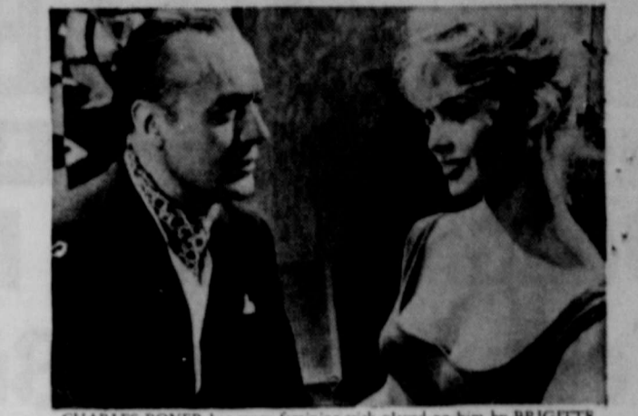
CHARLES BOYER has every feminine trick played on him by BRIGITTE BARDOT in United Artists' Technicolor release, "LA PARISIENNE"