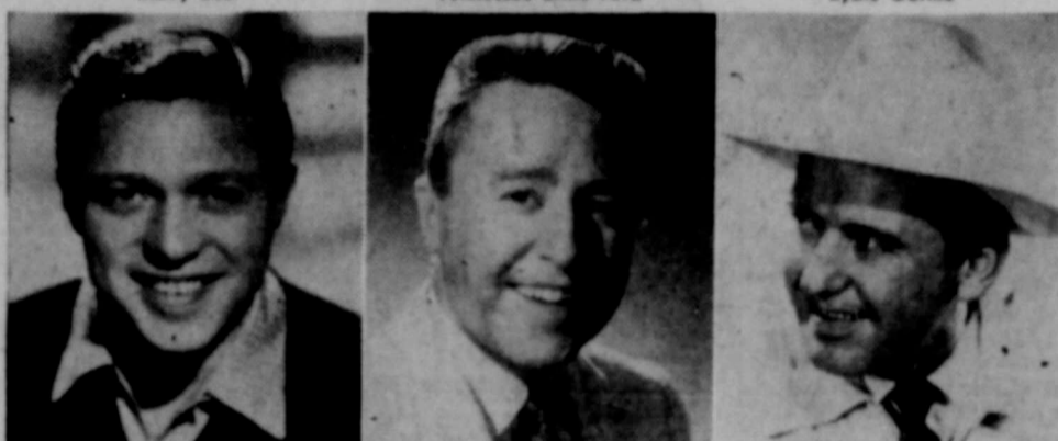
The State Fair of Texas will present a glittering "Shower of Stars" in the Cotton Bowl during the 1958 exposition, October 4-19. Among the big-name entertainers to be featured are Molly Bee and Tennessee Ernie Ford October 5, Edie Gorme and Steve Lawrence October 9, George Gobel October 14 and Red Foley October 15. Other "Shower of Stars" events will include Tito Guizar October 6, Meredith Willson conducting the fair's Music Festival October 7 and television's popular "Sky King and Penny" October 10.