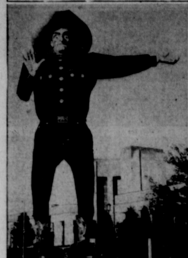
"Big Tex," the towering 52-foot cowboy statue who rules as the symbol of the great State Fair of Texas, is ready to welcome some two-and-a-half million visitors to the giant exposition in Dallas, October 4 through 19.