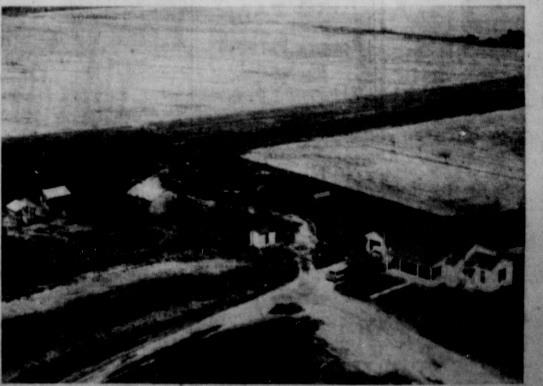
MYSTERY FARM—Mystery Farm No. 17 may prove to be a hard one to identify, but some lucky person will win two passes to the Majestic Theatre if they can correctly name the farm.

The body is being returned to California from Killingsworth Funeral Home in Ranger.