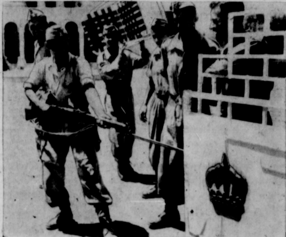
THEY LAUGH AT THE CROWN— An Iraqi soldier points his bayoneted rifle at a crown on the wall of the late King Faisal's palace in Baghdad. His laughing comrades appreciate the grim jesture. Not far from here, Faisal was machine-gunned to death when the army-led coup took the country with sudden violence.

TRADE WITH YOUR HOMETOWN MERCHANTS UPHOLSTERING Furniture and Automobile Also Canvas and Tarpaulin Repairs We Cover Boat Seats EDGAR'S 309 Main Ranger