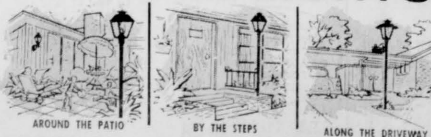
AROUND THE PATIO