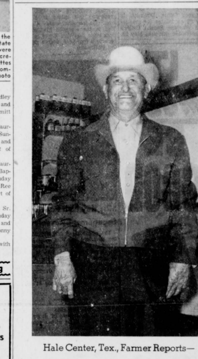
Hale Center, Tex., Farmer Reports—8100-pound Average Grain Sorghum Yield