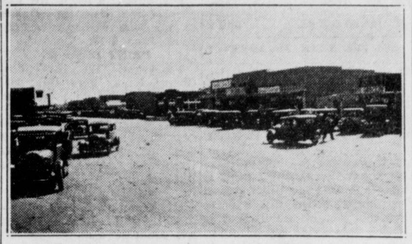
Looking West On Main Street In Sudan Last Trades Day