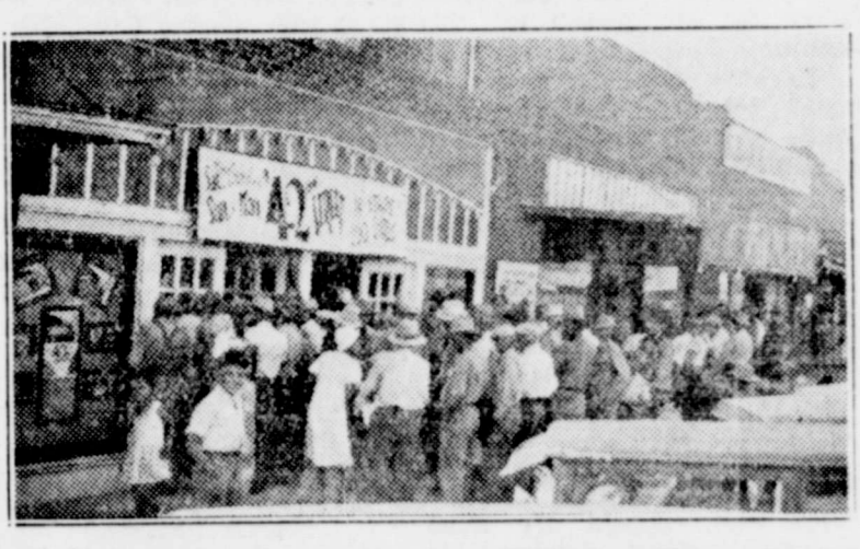
Crowd Waiing To Get In Picture Show Last Trades Day