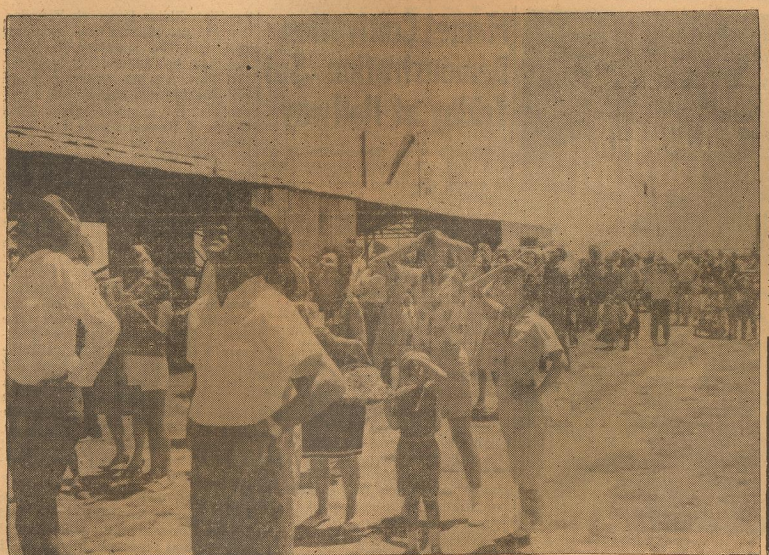
EYES TO THE SKY were found at the Dimmitt Airport Sunday afternoon during the Dimmitt Jaycee Annual Airport Day. About five hundred persons watched the parachuters and the stunt flights. Approximately 300 Walter Jeton Barbecue tickets were sold to airport visitors.