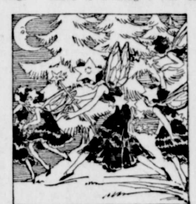
The Night Fairies.

much. I hope you will choose hideand-go-seek as one of your games before you begin the dancing."