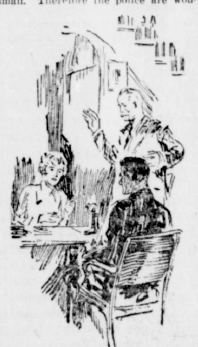
Why, What Applicant?" Cried doth Men.

"I mentioned that the weapon used in the attack must have been very small. Therefore the police are won-