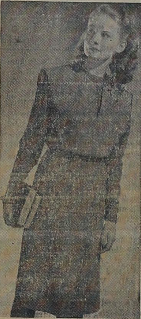
Can't sew? This simplified version of a jerkin and skirt team says you can. It's in bright green wool with slashed neckline and extended shoulders. Girls who sew augment their War Bond savings. Patterns at local stores.