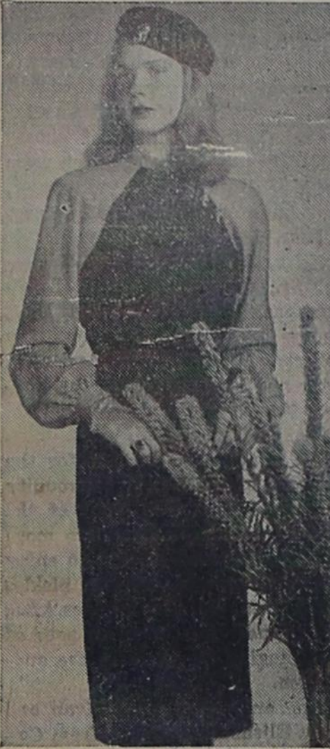
Two pieces look like one in this willowy, afternoon style. The dress is moss green rayon twill with contrasting winged sleeves and stand-up collar of gold. Sewn at home, it saves for War Bonds. Patterns at local stores. U. S. Treasury Department