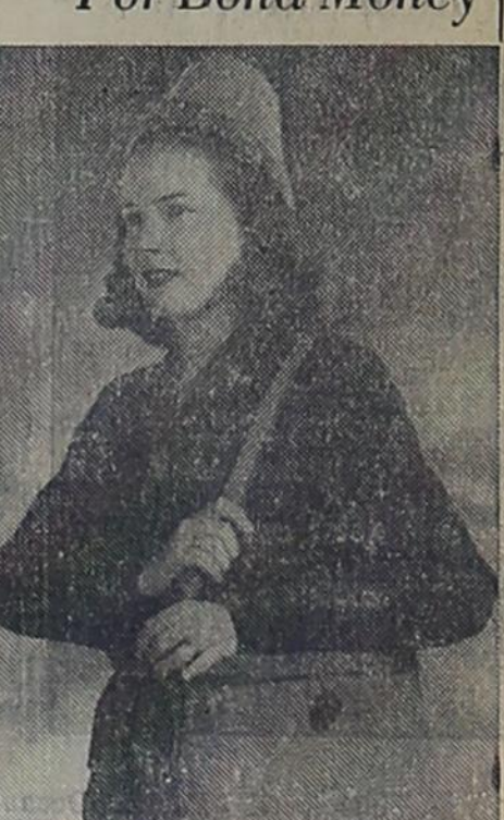
To save extra dollars for War Bonds make your own accessories. This perky cap is knitted of flame red wool, cuffed with navy felt. The matching shoulder-strap bag is for schoolroom paraphernalia. Patterns at local stores. U. S. Treasury Department