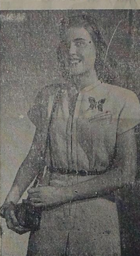
The outdoor look is achieved in this streamlined sports dress of muted pink gabardine. Patterns for school, office or sports available at local stores. Make your own and save for War Bonds.