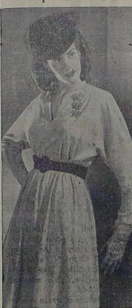
Beige wool jersey monks' type dress is one of the more simplified sewing patterns to be found at local stores. Making your own clothes is the answer to a fat War Bond folder. U. S. Treasury Department