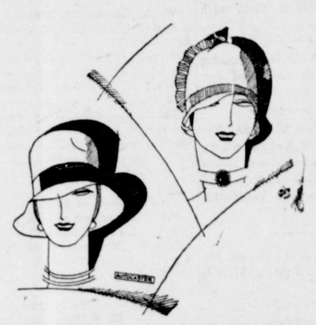
Ladies', Misses and Children's Hats

All the important Fall models are included in this group of new hats for wear now and throughout the coming season. The majority of these are fashioned of fine soft imported felts but some are combined with velvet. All have those little touches that make them what they are-smartly sophisticated! New creases, tucks, folds, 'pinches' new tailored trimmings of ribbon, sparkling rhinestone pins and buckles. In large and small shapes, with perky new brims. The new shades include Napoleon blue and maroon, as well as navy, beige, all shades of brown, and black.