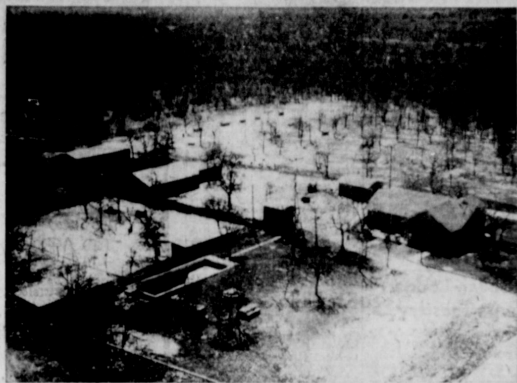
MYSTERY FARM—This is the first of a series of aerial photographs of Eastland County farms which will be published in this newspaper each Tuesday...