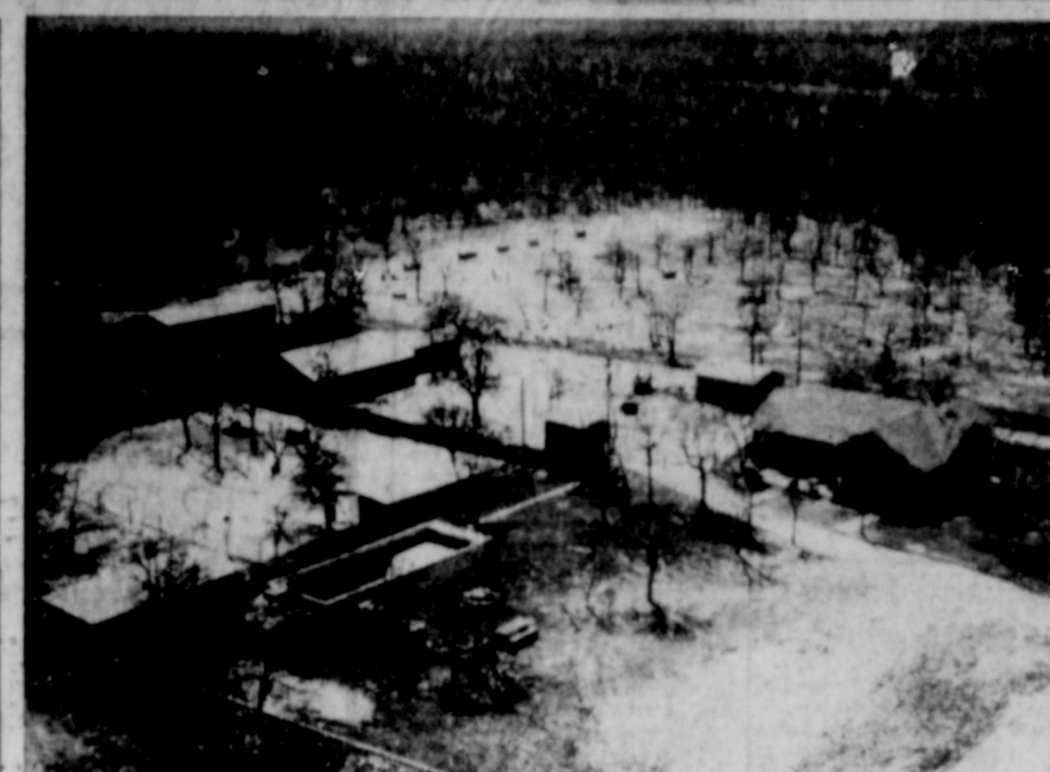
MYSTERY FARM—This is the first of a series of aerial photographs of Eastland County farms which will be published in this newspaper each Tuesday. In all 52 farms were photographed. Not even the editor knows whose farms were selected. The first person who correctly identifies the picture will receive two passes to the Majestic Theatre. And the owner of the farm will receive a free mounted enlargement of the farm if he calls at the newspaper office.