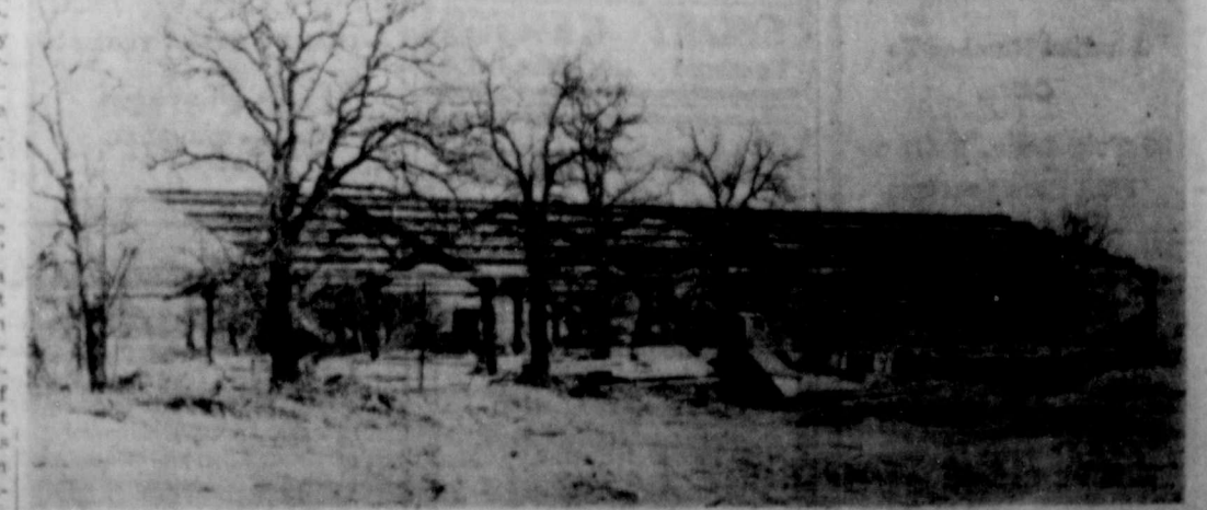
CLUBHOUSE IS GOING UP—Folks driving around Lake Leon in the last few days have been surprised at the progress made on the new Lake Cedar Country Clubhouse during the past week.

BE SURE—SEE Don Pierson Olds-Cadillac—Eastland Quality Cars at Volume Prices