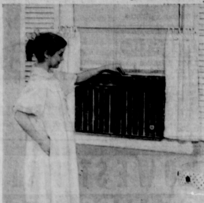
New air conditioner, only 13 inches high and deep, permits drapes to hang freely. It's easy to install, too.

The nutria cabinet has been given modern straight-line styling to harmonize with furnishings in any room. Its shallow depth permits even hang of draperies.