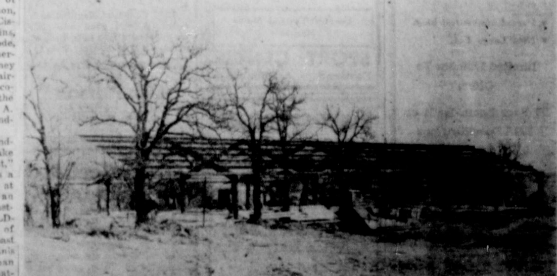
CLUBHOUSE IS GOING UP—Folks driving around Lake Leon in the last few days have been surprised at the progress made on the new Lone Cedar Country Clubhouse during the past week. The picture above was snapped Thursday afternoon. At the time eight workmen were busy. Brick is expected to start going up in the near future. (Staff Photo).

See The RCA WHIRLPOOL APPLIANCES at RANGER FROZEN FOOD CENTER