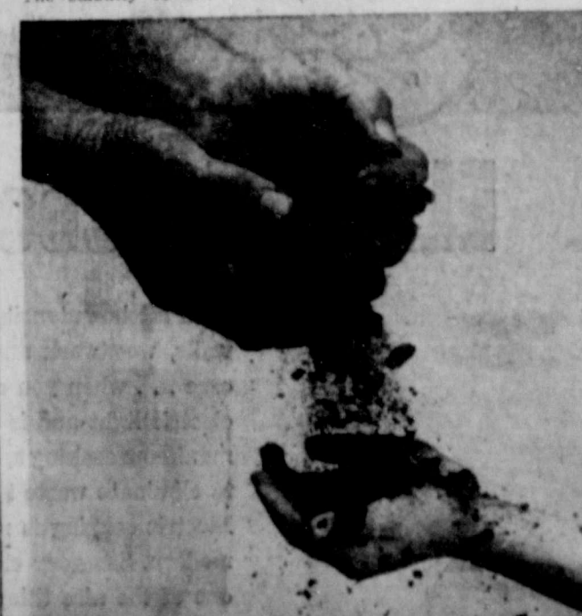
CRUMBLY OR CLODDY—Crumbly soil is in good tilth and a pleasure to work. Cloddy soil is hard to work and restricts plant growth.

can only be built up and maintained with cropping systems which return large amounts of plant residue to the land.