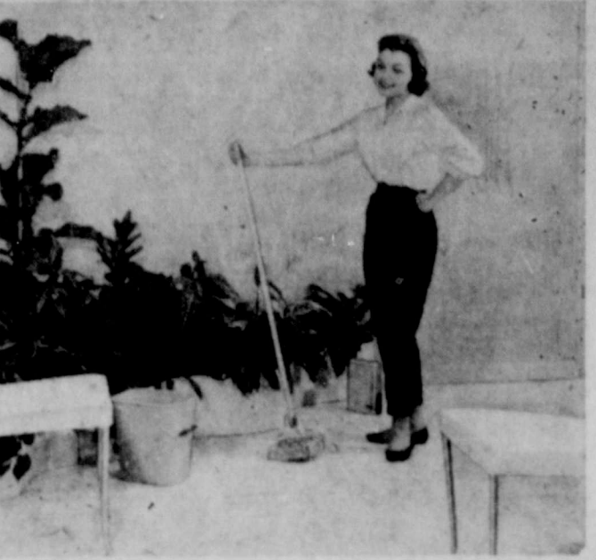
Green plants, airy furniture and a sturdy tile floor combine to make a foyer attractive and easy to clean.

Lavish use of green plants not only looks pretty, it creates an outdoor air that helps to make the foyer look larger. This theme can be carried out in wallpaper and in light and airy furniture groups.