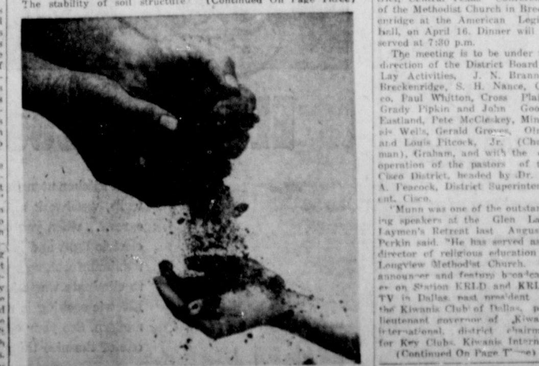
CRUMBLY OR CLODDY—Crumbly soil is in good tilth and a pleasure to work. Cloddy soil is hard to work and restricts plant growth. Good management makes soil crumbly easy to work and allows maximum plant growth.

of much soil puddling in this vicinity. Compaction by livestock hoofs on wet soil has about the same effect as plowing too wet. Many soils even on native grasslands of this area show "hoof pans" resulting from wet grazing. A good litter of grass residue on a grassland will do much to cushion livestock trampling. The stability of soil structure can only be built up and maintained with cropping systems which return large amounts of plant residue to the land. Best results are obtained from plant residue if legumes are used in the rotation or nitrogen fertilizer is used for the specific purpose of decomposing starchy plant residue. The maximum potential plant