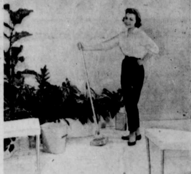
Green plants, airy furniture and a sturdy tile floor combine to make a foyer attractive and easy to clean.

THE foyer offers guests the first impression of a home. It can be bright and attractive or a sort of catch-all for umbrellas, wraps, toys and the clutter of family mail. Since it does offer that important first impression, it's up to the homemaker to turn the foyer into a small but special room. An ideal floor is one that's tough, colorful and easy to keep clean. Here, you can combine two or more colors and even use brass inserts for true elegance. A swish of the mop with special cleaning product, designed especially for such flooring, just once over the surface will make the floor come clean without rinsing. Lavish use of green plants not only looks pretty, it creates an outdoor air that helps to make the foyer look larger. This theme can be carried out in wallpaper and in light and airy furniture groups.