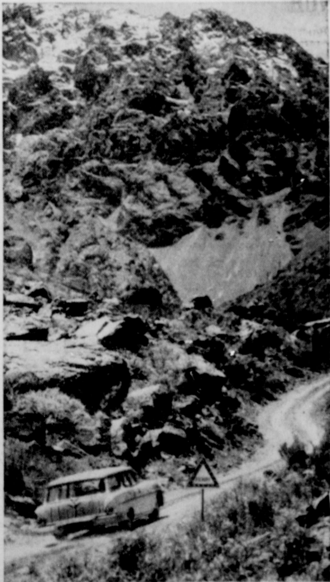
The sure-footed Chevrolet purrs past a road sign that says "danger" and ahead lies the toughest part of the perilous Andean climb.