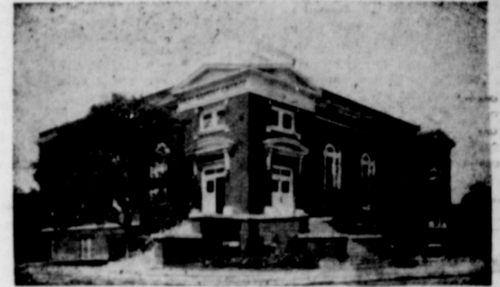
First Baptist Church