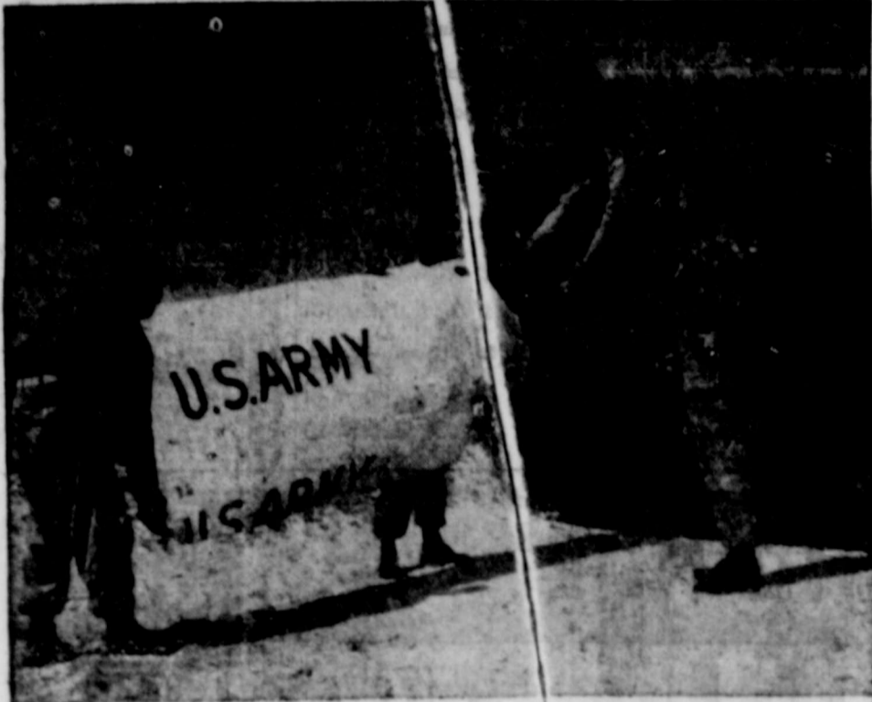
LAST RIDE—This piece of a spent Army missile, recovered from the impact area at White Sands Proving Ground, N.M., is on its way to a guarded "graveyard." Every scrap is rescued, for scientific analysis, for safekeeping from prying eyes, or because it may be dangerous.