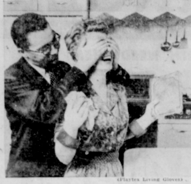
Even a gag or two doesn't upset this hard-working housewife. Polishing the silver with protective gloves eases . . . erry about rough, red hands.

THE work that any homemaker goes through at the start of the holidays must be repeated when the holiday season is over. The special silver must be polished again and put away. The company china and crystal are washed and put back on clean shelves. Candelsticks are cleaned of wax and made ready for use. The fine household linens get a bath in gentle suds and are rolled and wrapped away in their drawers. By this time, the house shines and the homemaker's hands are rough and red. Best protection against the effects of cleansers, polishes and the heat of dishwasher are household gloves. The newest come in decorator colors: mint, pink, turquoise or maize. They're made of latex and have a soft cotton lining. They're contoured for sleek fit and cut with wide turnback cuffs to protect sleeves and arms. In addition to using the gloves, keep a bottle of hand lotion on your kitchen shelf and use it liberally as you finish each task.