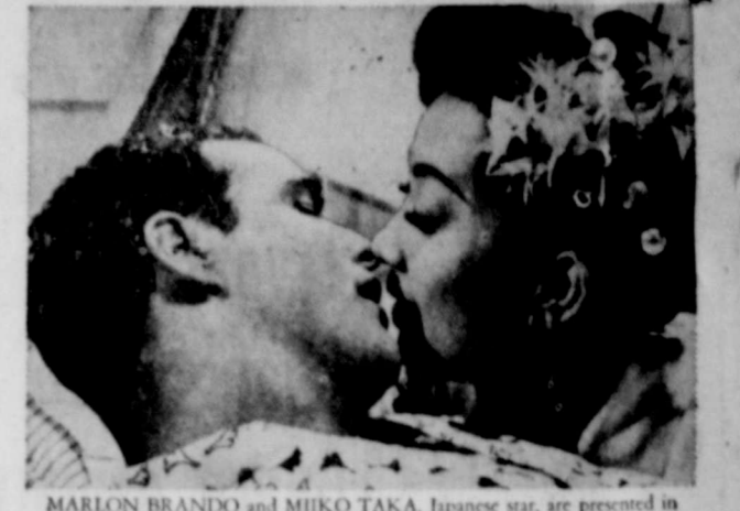
MARLON BRANDO and MIIKO TAKA, Japanese star, are presented in Warner Bros. "SAYONARA" photographed in Technicolor. See This Academy Award Nominee