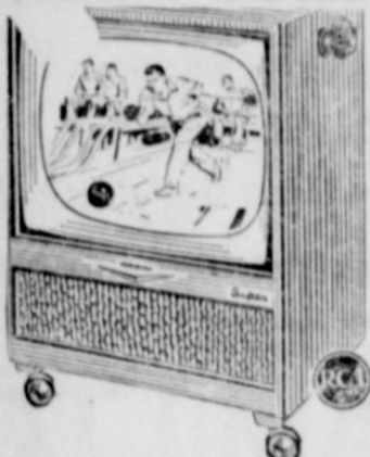
The Langston. New TV that rolls from room to room! 26 1/2 sq. in. viewable area. New "Mirror-Sharp" picture. "Lean, Clean" styling. Mahogany- or lined oak-grained finishes. 21T840.