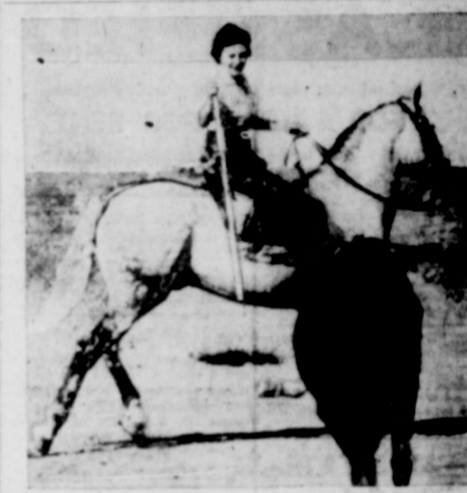
BEAUTY AND THE BULL—Moody motion picture star Ava Gardner is reportedly conferring with beauticians, doctors and make-up men about removing evidence of a recent disagreement with a fighting shorthorn bull in a private bull ring. Ava, long and avid fan of bullfighting, is shown jousting with a young cow in Madrid, Spain, just before the accident. She says heavy make-up conceals the "dimple" in her face remaining from the reported butting she suffered.