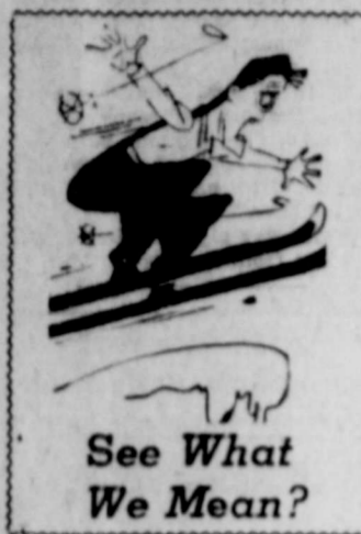
See What We Mean?