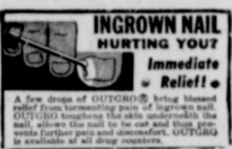
INGROWN NAIL HURTING YOU Immediate Relief