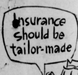
Let us measure

sioners of Texas. neither the actuary, examiners, or ance Code.) sistant examiners working under