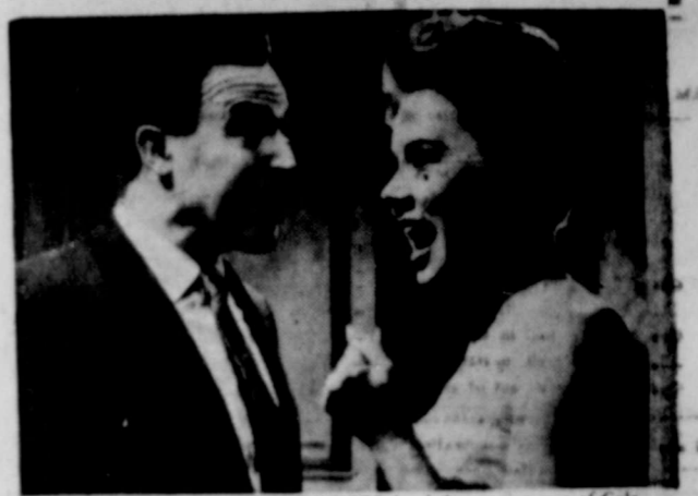
GENE KELLY and MITZI GAYNOR head the starring cast of Cole Porter's 'LES GIRLS', MGM's new CinemaScope and color musical.

Time Magazine says: "The years best music and comedy."