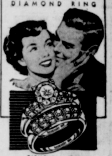
CASALOMA Also 125 Wedding Ring 75.00 300