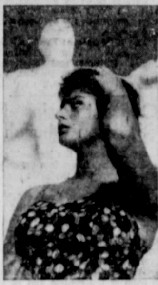
SOPHIA LOREN, herself statuesque, seems confused as to what to look at next in statufilled Washington, D. C. The Italian film star was in the Nation's capital to make scenes for a new movie, and found that touring is tiring.