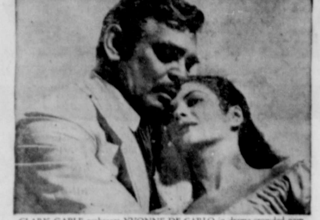
CLARK GABLE embraces YVONNE DE CARLO in drama-crowded new Warner Bros. film, "BAND OF ANGELS." SIDNEY POTTER CO-STARS.

The critics say "A Miniature 'Gone With the Wind.'"