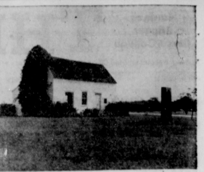
Historians dispute if the building in Washington State Park, pictured above, is an accurate replica of the smithy shop in which the Texas Declaration of Independence was signed. Contemporary drawings differ. Close by is the restored home of Dr. Anson Jones, last president of the Republic of Texas. A large sign on State Highway 90, near its bridge over the Brazos river, shows the way to the park.