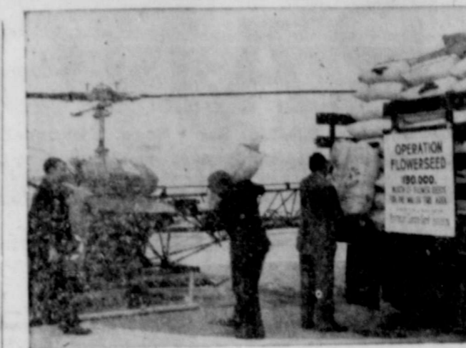
"Operation Flower Seed" is now underway in the fire stricken Malibu area of California. More than 10,000 pounds of assorted flower seeds were donated to Los Angeles County by the American Seed Trade Association to assist in the rehabilitation and beautification of more than 30,000 acres of Malibu destroyed in the raging blaze this winter. County officials are shown transferring sacks of the seed to helicopters which are sowing the seeds on the hills and other hard-to-reach spots. Boy and Girl Scouts, Civil Defense workers and other volunteers are also sowing other areas with the seed, which is valued at $150,000. The flowers will provide a quick ground cover and add fragrance and beauty to the now blackened earth.

SHARE YOUR NEWS WITH OTHERS. Please call 224 and tell us about it. We genuinely appreciate hearing from you.