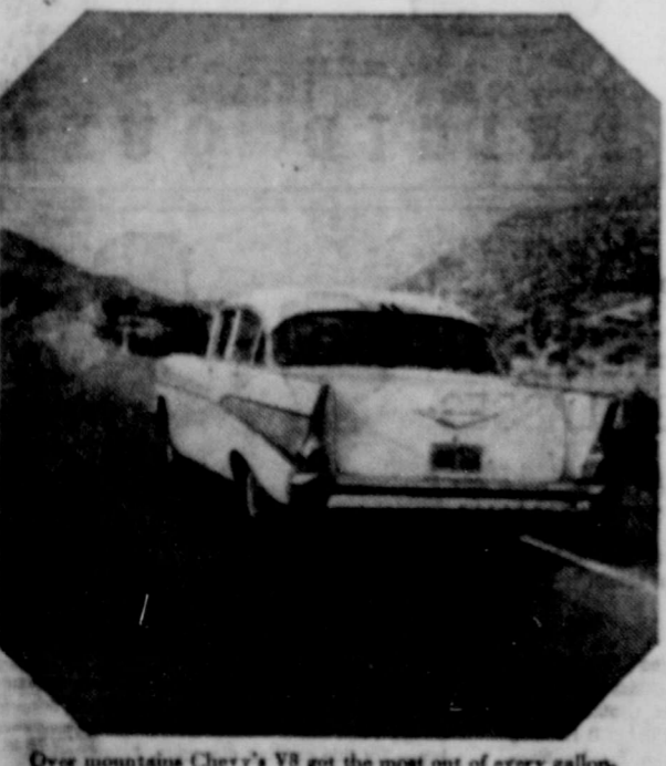
Over mountains Chevy's V8 got the most out of every gallon.