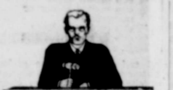
IT'S THE LAW in Texas A public service bureau of the State Bar of Texas