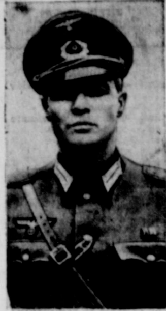
ACHTUNG! —Making with the hard look of the true Nazi is actor Marlon Brando. Marlon is impeccably dressed in true Wehrmacht style for his part of a young German officer in "The Young Lions," a film adaptation of the best-selling World War II novel by Irwin Shaw.