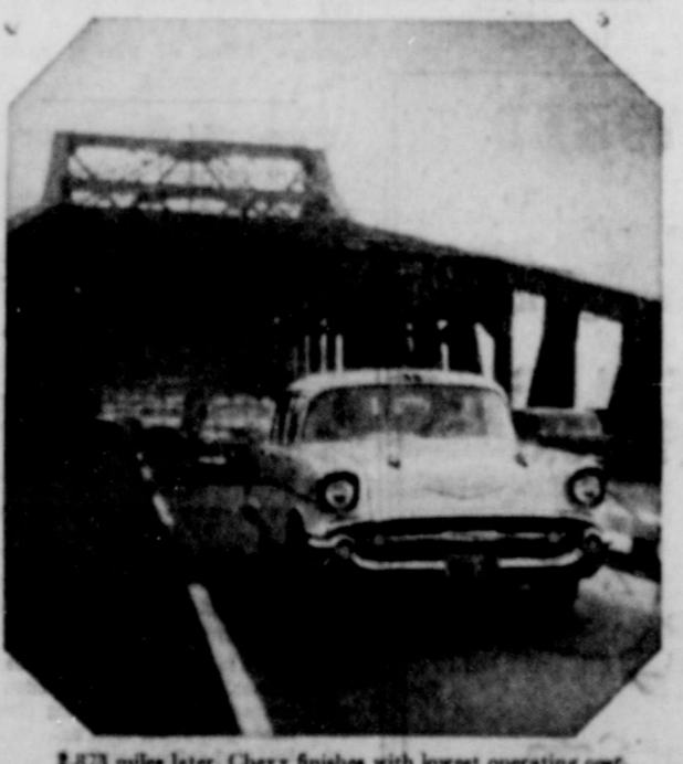
2,273 miles later, Chevy finishes with lowest operating cost.

Only franchised Chevrolet dealers CHEVROLET display this famous trademark See Your Local Authorized Chevrolet Dealer